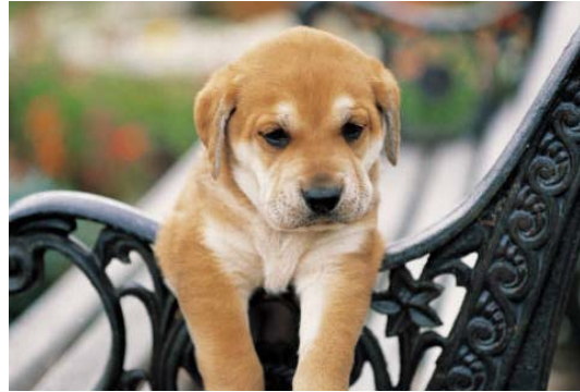
Caption describing photo or graphic.

great way to communicate with family and friends on a regular basis.